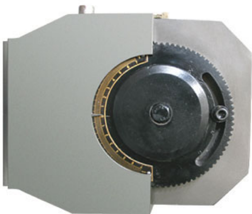
Impression Adjustment by Worm Gear & Eccentric Bushes