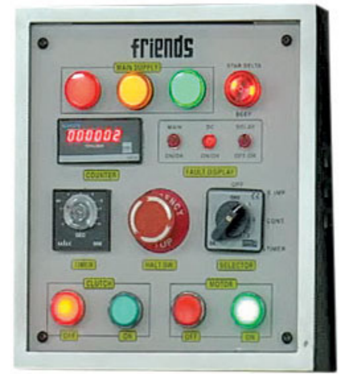
Operational Panel Side Mounted (Detachable Socket System)