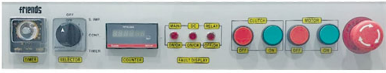
Operational Panel Front Mounted (Detachable Socket System)