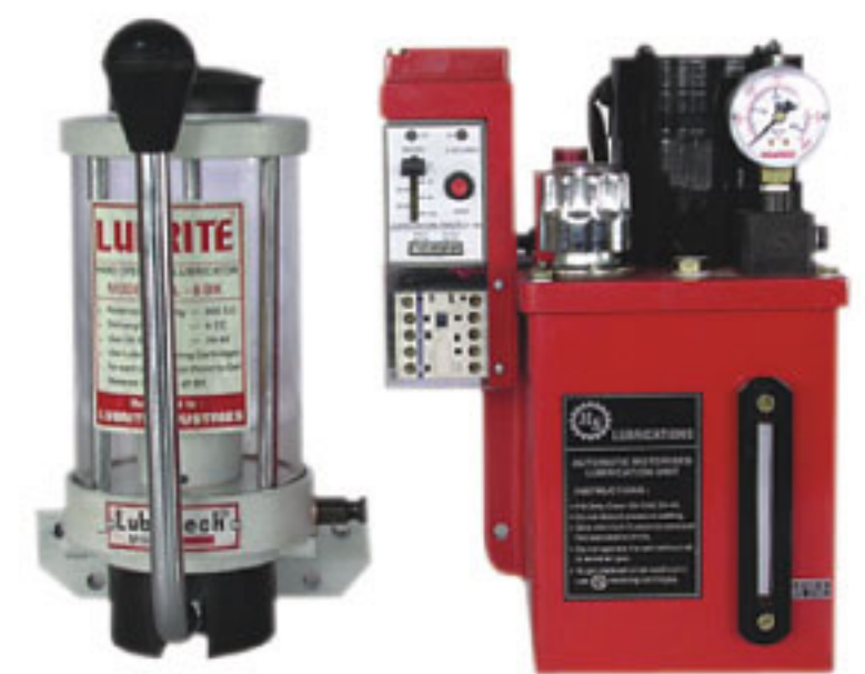
Auto Lubrication Pump