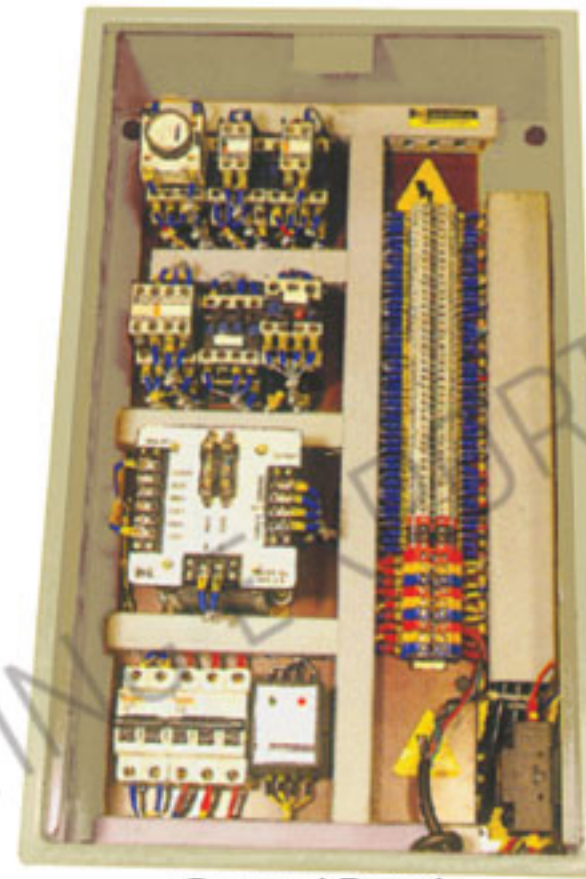
Control Panel (Detachable Socket System)