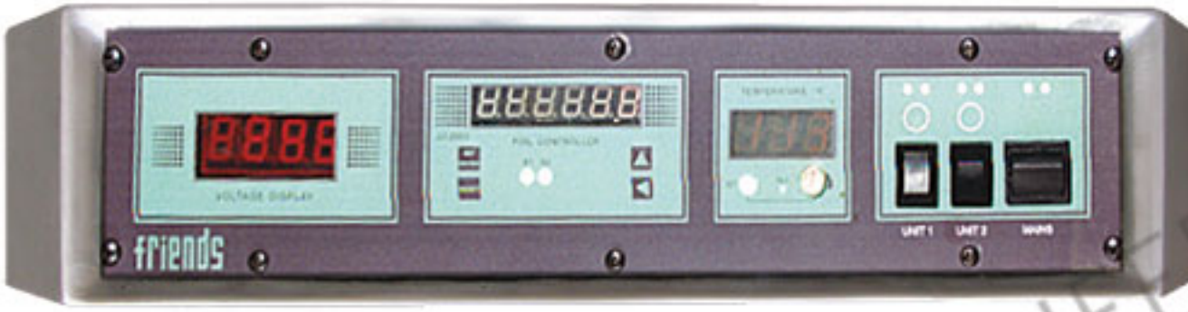
Programmable Operational Panel of Foil Printing Machine (Detachable Socket System)