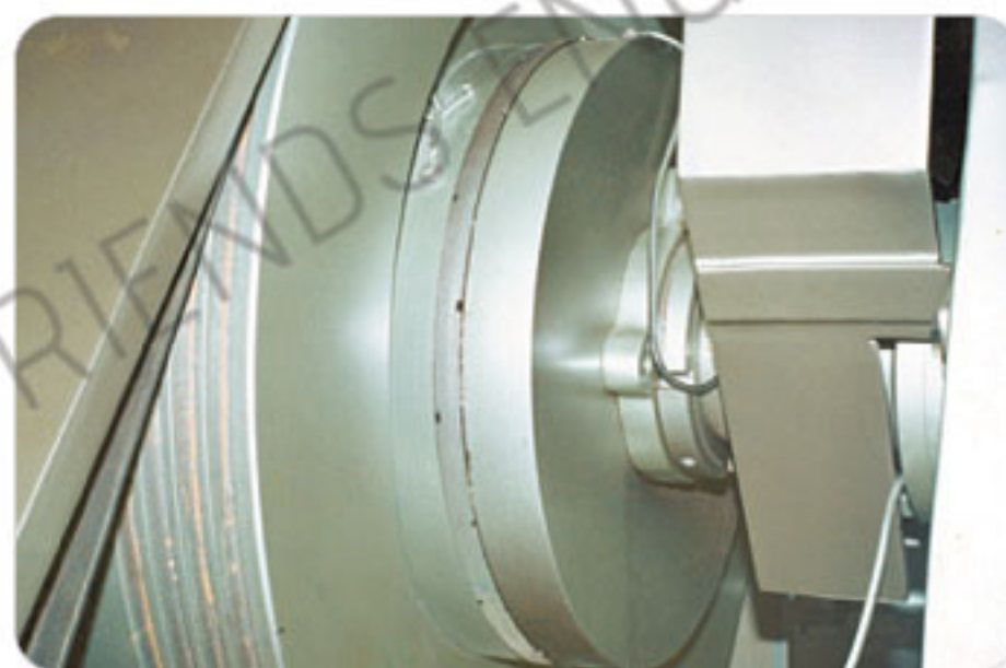
Electromagnetic Clutch & Brake System for Microns Adjustment